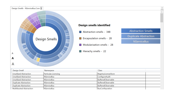
Figure 4: Sunburst Representation of Smells for Effective Navigation and Filtering